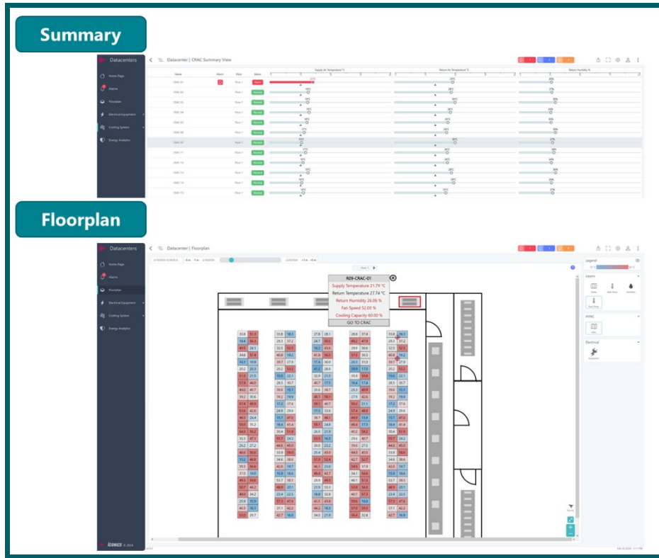
Figure 3. A “single pane of glass” providing a holistic view of a data center’s operations.

Systems users frequently support multiple facilities and may not always be actively monitoring status. A typical scenario involves a facilities manager being notified of an operational abnormality in a critical system, such as a computer room air conditioning (CRAC) unit. In this case, the manager would access the monitoring application to view the asset’s status, as illustrated in the summary display, and assess the operational impact shown on the floor plan.